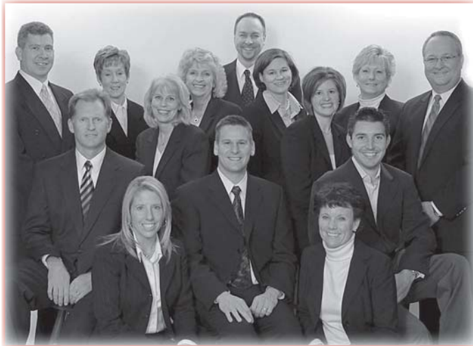
Not Pictured Chad Wood

The use of our bulk stamp is available to members only.